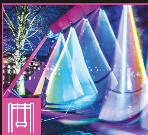
Swing Song Tired Industries & Bristol Light Festival

Bristol Light Festival's very own Swing Song is back! A set of six interactive swings which light up and play music as you swing back and forth. Swing high for a crescendo or gently for more ambient vibes.