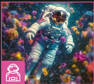
Ascendance Studio McGuire

A World Premiere for Bristol Light Festival by Studio McGuire, this interstellar installation depicts an astronaut floating in an imaginary galaxy of blooming flowers and shooting stars.