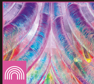
Elysian Atelier Sisu