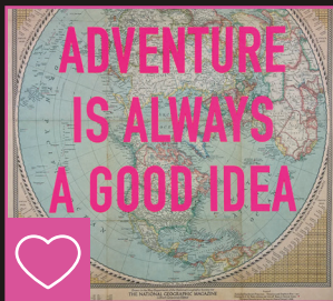
Bristol is always a Good Idea