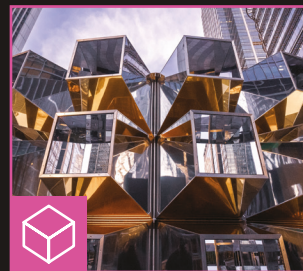
Emergence This is Loop

A huge, mirrored structure, completely reflective to provide audiences with a new perspective of a once-familiar space. Intended to act as a place of contemplation amongst the chaos of the outside world.