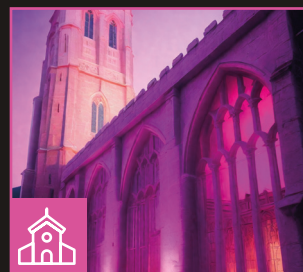
The Unfolding SLX & Bristol Light Festival