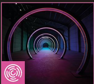
Pulse This is Loop

Pulse is a 40-metre long immersive, audio-visual installation made up of more than 14,000 individual LEDs. Step inside enormous rings of light and experience a new perspective on Bristol.