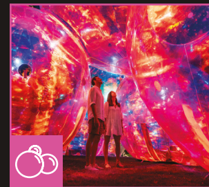
Evanescent Atelier Sisu

Immerse yourself in the giant inflatable bubbles which have appeared in College Green. Evanescence by Australian artists Atelier Sisu encourages audiences to explore our delicate world with a sense of play and wonder.